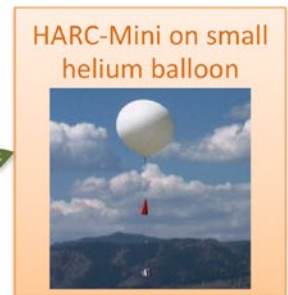
HARC-Mini on small helium balloon

HARC-Mini is optimized for Half-Duplex (Push-To-Talk) radios operating with any land mobile radio including P25, TETRA, heritage trunking systems, VHF voice, UHF voice, and AM. Various battery sizes and external power options are available, making HARC-Mini universally configurable.